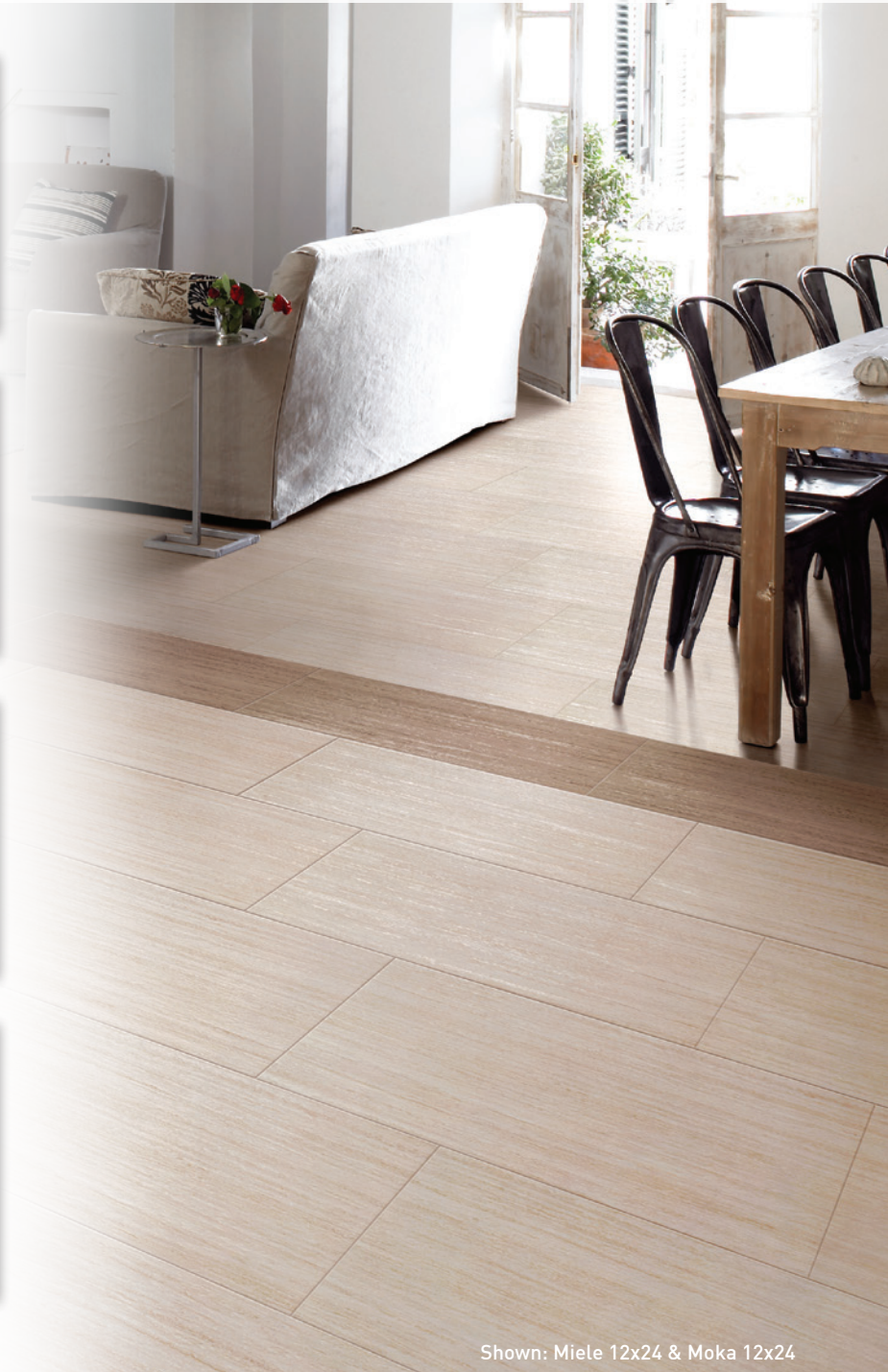
Shown: Miele 12x24 & Moka 12x24